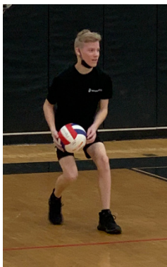
Staff vs. Grade 8 volleyball game!